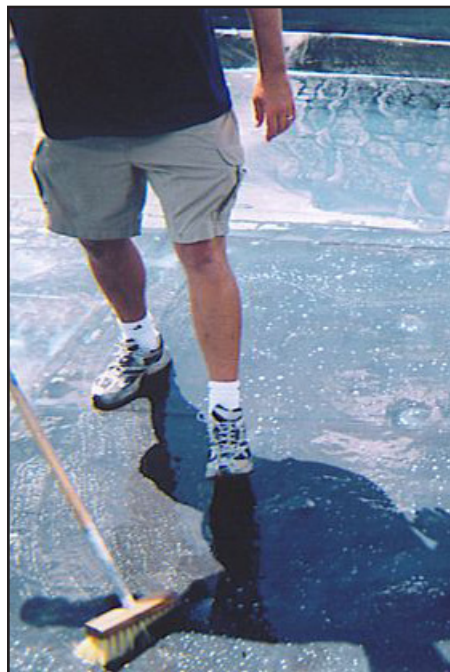
BUR roof being cleaned with MultiUse Cleaner