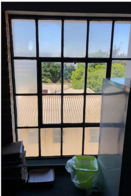
Window panes cleaned with MultiUse Cleaner (center) are visibly brighter!

Intended for Commercial & Industrial Use Only